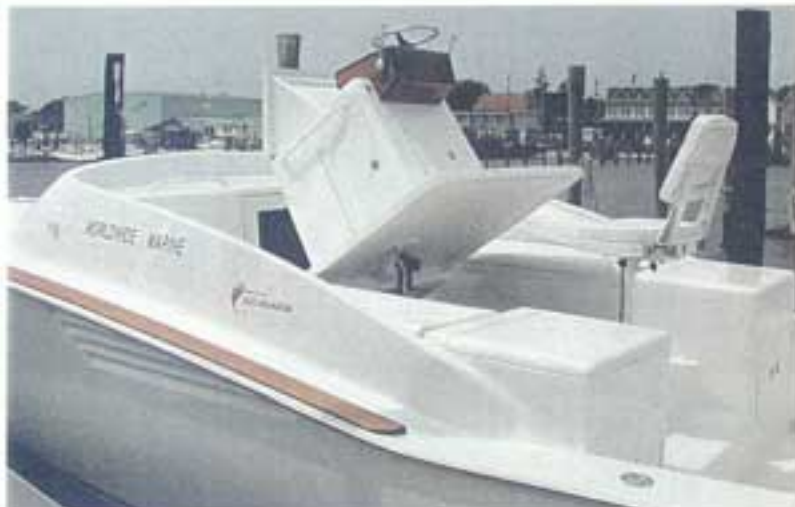
The helm pod lifts with the flick of a switch to provide ready access to the wide-open engine compartment below.